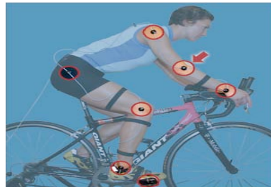
8 point active marker tracking system